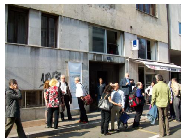
ASSITEJ Executive members outside the new Secretariat in Zagreb. No frills.