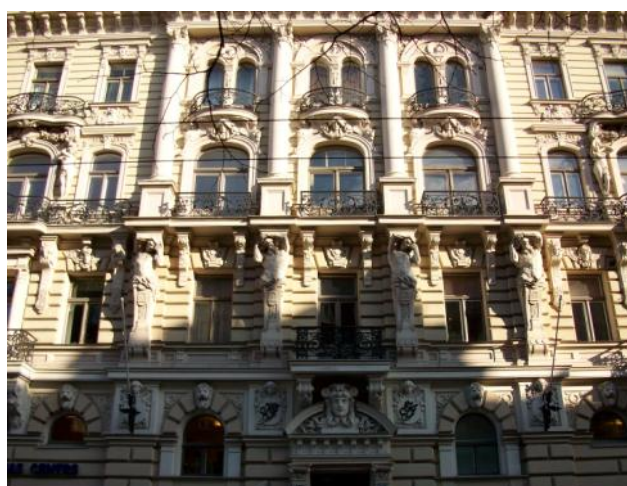
Jugendstil extravagance in Riga, wealthy and cultured since the 16th Century. A mix of German and Russian traditions with the arts crucial to expressions of national identity.