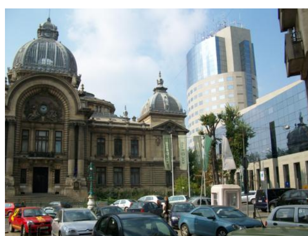
Romanian Central Bank in Bucharest. Old and new. With global capitalism in freefall, which building will still be standing in 2108? And everyone has borrowed money to buy a car ...