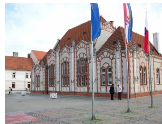
The former Jewish 'casino' in Cacovec, Croatia.