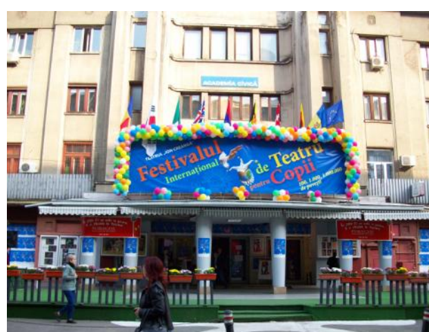
Teatrul Ion Creanga, Bucharest, host of the 100,1,000, 1Million Stories Festival 2008 .