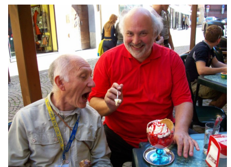
Italy is famous for ice cream ...