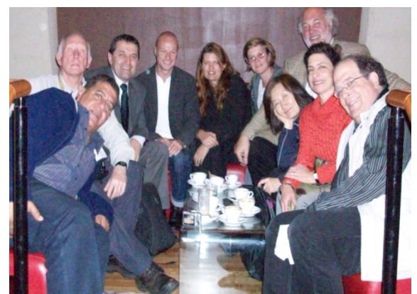
Final EC session to review festival shows