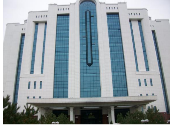
Open for Big Business

Uzbekistan is a magnet for International commodity firms - gas, cotton, metals