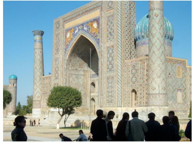
17 th Century Registan in Samarkand

Most of today's mature theatre workers trained in Russia or in Tashkent's higher education institutes for theatre arts, dance, design and music - still staffed with teachers trained in leading Soviet institutions. On the evidence of the skills displayed at the 2011 Theatre UZ festival, actors from Central Asia are fast on their feet, highly competent technically and working to the highest world standards. They are artists too. So far, the commercial pressures which so influence theatre in the West have not seriously affected theatre people's desire to be, first and foremost, part of an artistic community.