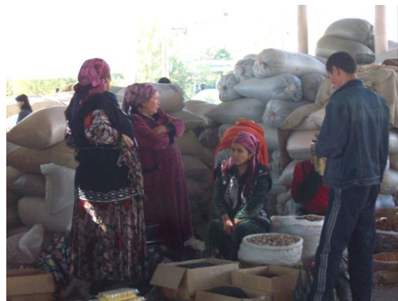
Best value for basics is at the Market

Uzbekistan is a magnet for International commodity firms - gas, cotton, metals