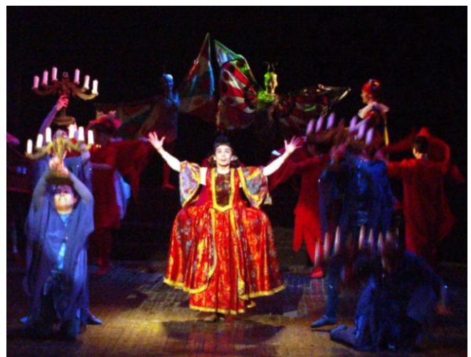
Little Match Girl