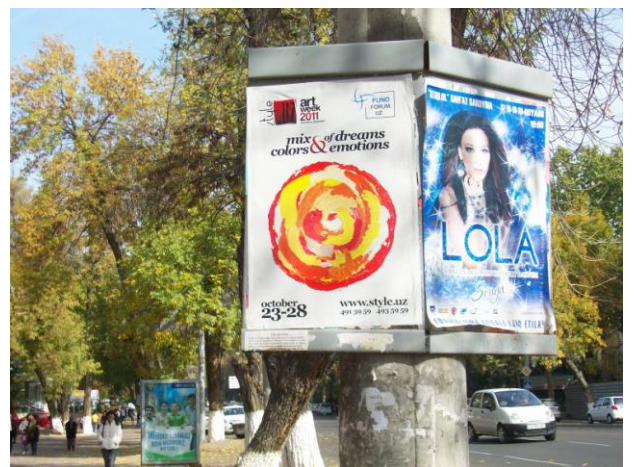
Festival poster in a tree lined avenue