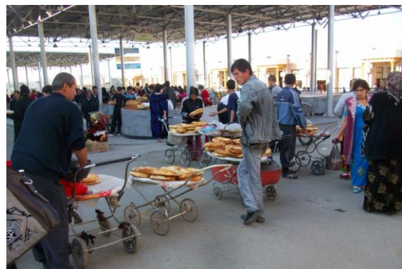
Bread from Samarkand is legendary

Real life, food, family and fellowship mean a lot still. So does Culture.