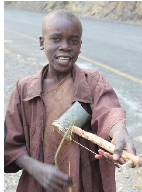
Roadside musician near Lake Kivu...

I met the newly appointed Director of National Museums, returned from the UK with a CV which includes time at the V&A. A theatre project involving the young actors we worked with may be the outcome of some intense sharing of ideas about modernising Rwanda's colonial-era museums. Should Rwanda's museums earn cash by selling to tourists – gorillas, genocide and grass palaces, or should the emphasis rather be upon raising Rwandan's awareness of the positive aspects of their culture, developing a confident and unified national identity?