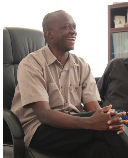
Culture Minister meets ASSITEJ ...