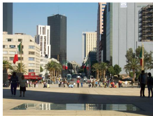
Downtown Mexico City ↑ ↓ ASSITEJ EC people at the Blue House