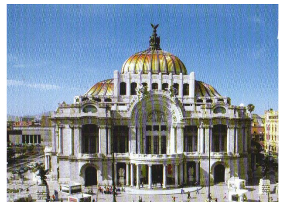
Palacio de Bellas Artes c 1930 ↑

Control + Click here to see a clip of UGA