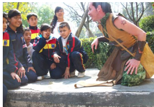
↑↓ La Legión de los Enanos

Visit www.assitej-international.org for more information. Congress in Copenhagen / Malmoe is at: www.assitej2011.info