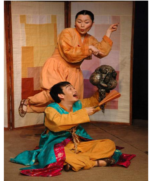
↑ Gamoonjang Baby (Korea)

A pantomime style show about vampire women and wrestling with operatic songs and a lot of fights in a huge opera house was crammed with families on a Sunday at 11am.